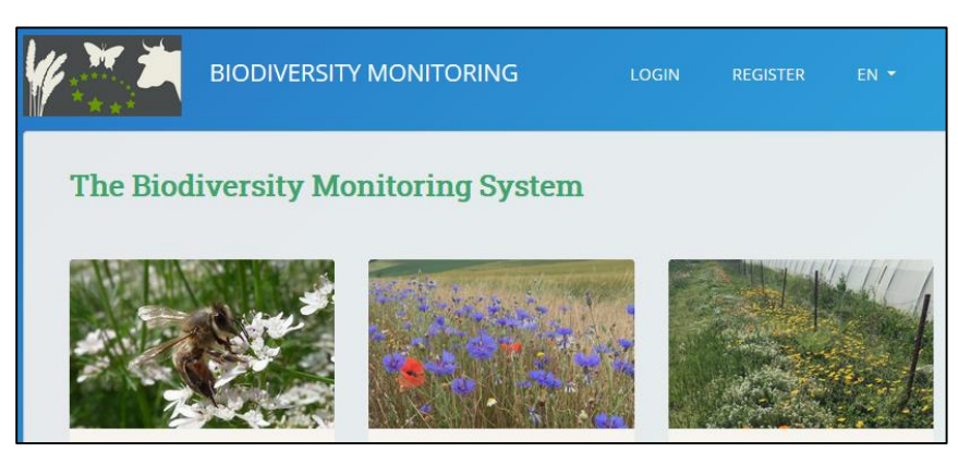
Internet address: https://bms.biodiversity-performance.eu/

The individual data sets are aggregated and can be viewed in different ways. The data are presented in nine thematically grouped clusters so that users can