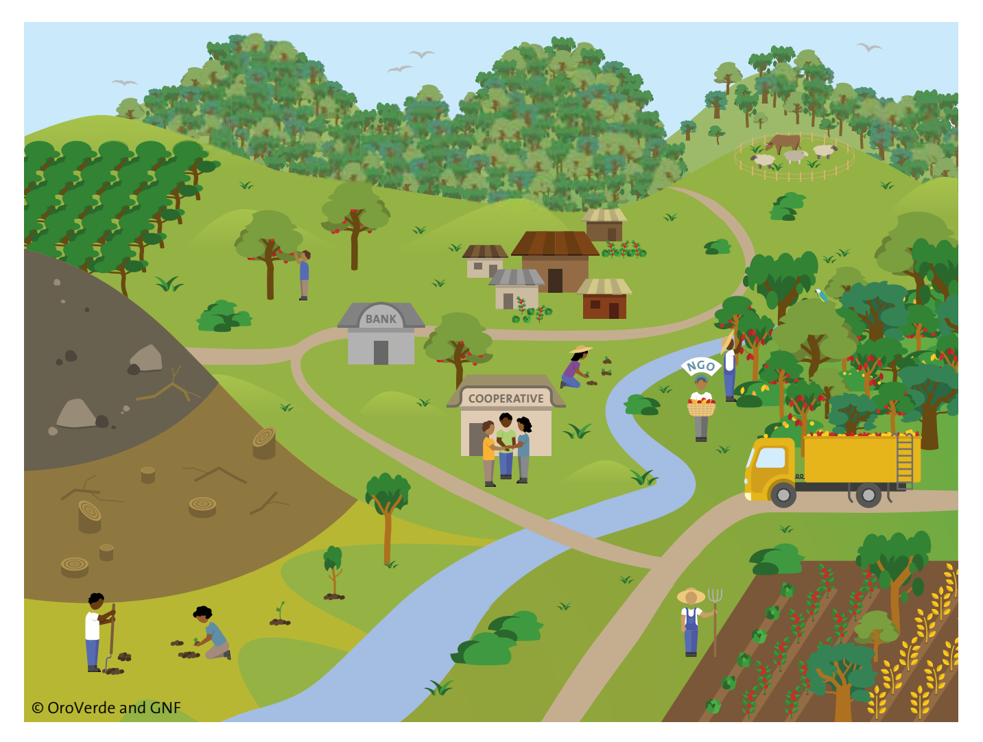
Fig. 1: Forest landscape restoration connects different stakeholders and land use requirements in one landscape.

Case study Dominican Republic: The model forest concept involves the various stakeholders in a participatory process and reduces pressure on the forest through human use. New tree seedlings are growing here.