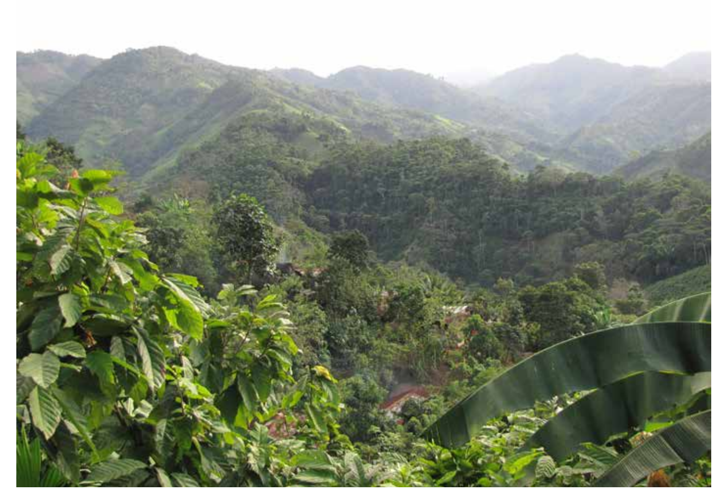
Support programmes such as those in Guatemala are an important instrument to foster the development of agroforestry systems and reduce risks for farmers.

Ensuring the sustainability and actual effectiveness of projects must be given greater consideration. This needs to be an integral part of planning and in discussions on measures for the reforestation of biodiverse forests landscapes in cooperation with the local population. Therefore, stable value chains and lasting incomes for smallholder farmers need to be ensured. They must be able to sustain themselves after the project has ended. In addition, a monitoring scheme should prove the effectiveness of soil regeneration, resilience to climate change and the improvement of biodiversity.