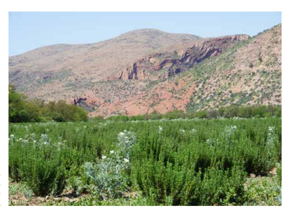
The cultivation of rosemary mixed with other crops and the production of essential oils allow farmers to reduce livestock and provide land for landscape restoration in the Baviaanskloof in South Africa.