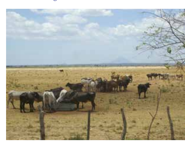
The transformation of rainforests into pastures leads to the destruction of the ecosystem and the degradation of soils.