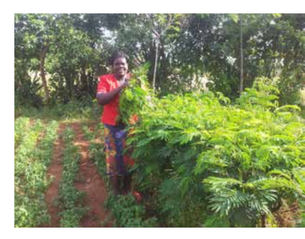
Implementation of SDGs in practice: In the Livelihoods Fund case study in Kenya, trees were planted to store carbon and fodder trees were cultivated to reduce open grazing areas.

Measuring progress in the restoration of forests and landscapes is often based on voluntary feedback from the respective countries and other stakeholders. There is often a lack of technical quality assurance in relation to the protection of biodiversity and the involvement of the local population. There is also a risk that large-scale monoculture plantations will rank among the restoration initiatives. Here, criteria and standards can provide initial assistance to ensure the conservation of biodiversity and ecosystem services as well as the involvement of the local population in forest landscape restoration.