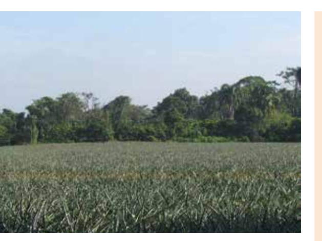
Lack of policy coherence and incentives for forest restoration can lead to the promotion of monoculture plantations.