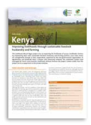
The case study documents can be found here: www.oroverde.de/flr