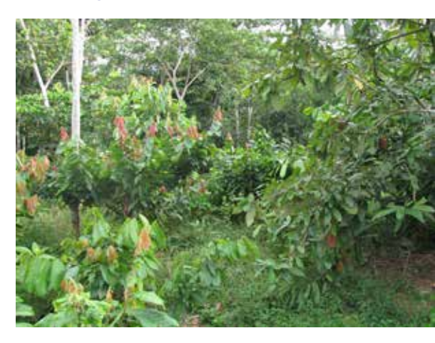
Agroforestry systems create new sources of income and reduce pressure on the rainforest in the Madre de Dios region of Peru.