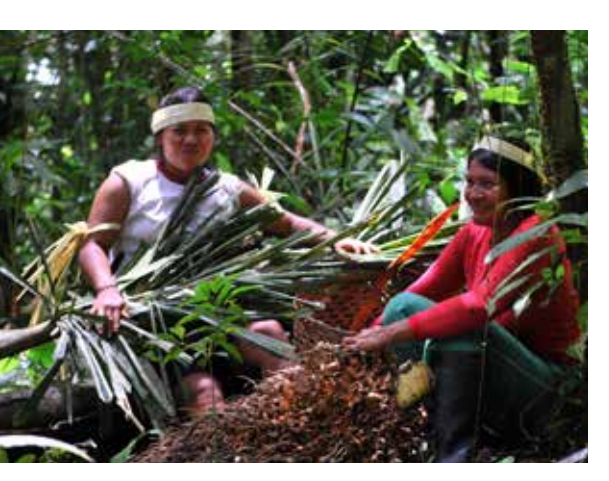
Integration of cultural knowledge of farmers' groups and indigenous people into the planning process is of great importance.

From the case studies and analysing the literature, the following important factors can be identified for long-term, successful Forest Landscape Restoration Initiatives<sup>2</sup>.