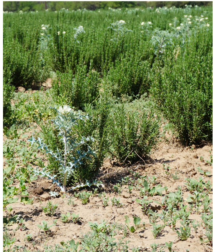
Rosemary cultivation is one of the building blocks of sustainable land management.