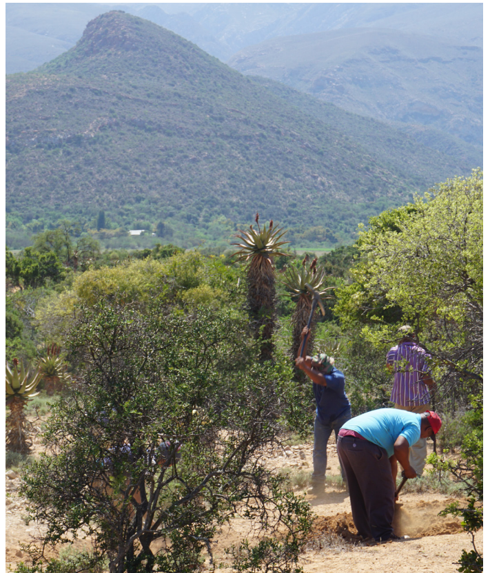
Community members are hired for digging water retention ponds.

Another challenge for FLR projects are the risks for the local population, which implements measures. In the Baviaanskloof, these risks arise from the shift from livestock to rosemary and lavender. Here, Commonland's investment and long-term commitment reduce the farmers' risks. The lower interest rates compared to market conditions and the greater flexibility in repayment reduce the risk for farmers going bankrupt. This advantage has already mitigated the income from essential oils that was lower than expected in the first years.