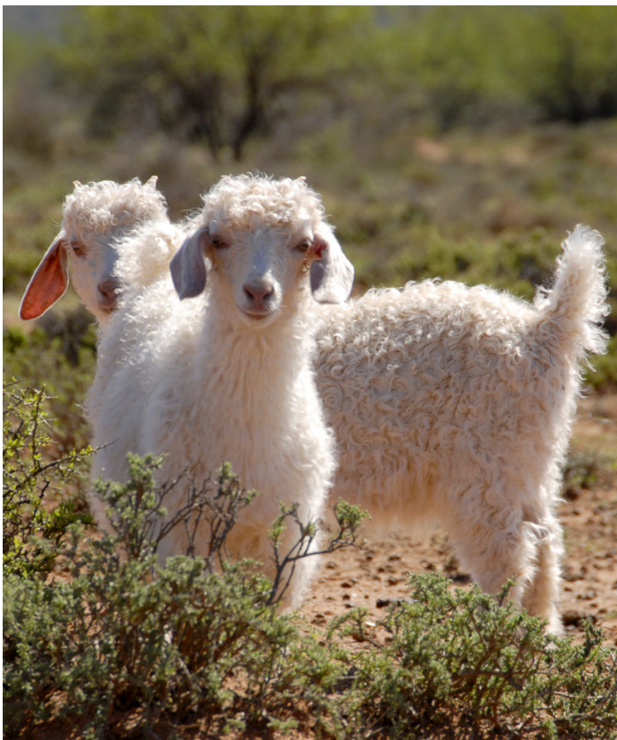
The Angora goats do not eat the herbs and can therefore graze on the cultivated area.