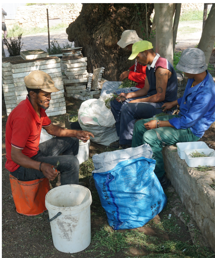
The workers prepare the rosemary cuttings for cultivation.

Commonland's four>Returns Framework is designed for large landscapes and is therefore basically scalable. However, experience with the Baviaanskloof has shown that new measures should first be tested on a small area before being implemented on a large scale. It is therefore advisable to start with pilot actions or to involve a local partner who has already gained experience with similar measures before implementing a large-scale project.