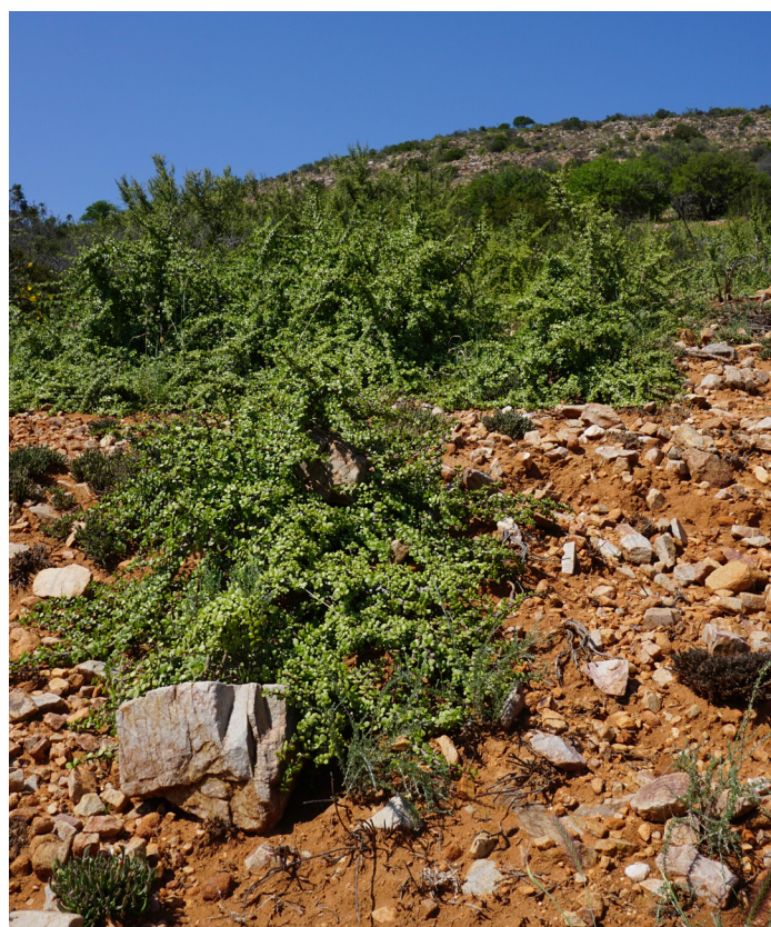
Planting the native Speckboom tree on the mountain slopes improves soil quality and protects against erosion.