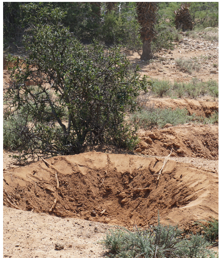
Semicircular water retention holes to reduce water runoff. These are dug by hand.

Regenerative agriculture is a completely new concept for DevCo farmers. The aim of the concept is to use the agricultural land economically while improving and maintaining soil quality and biological diversity. The measures in the Baviaanskloof valley on the farmers' land have been adapted to the soil conditions and needs of the respective farmers. Currently, only the four farmers of the Baviaanskloof Development Company (DevCo) are implementing regenerative agriculture practices. In cooperation with the DevCo General Manager, each farmer develops a management plan for his farm. This plan includes catch crops and fodder crops between the main crops for the diversification of the fields. In addition, all farmers have their own nurseries and produce compost that is enriched with nutrients and biochar to be used as a biological fertilizer. The cultivation of fodder crops ensures the feeding of the goats and enables the farmers to keep areas on the slopes for rehabilitation free from livestock. In addition, DevCo farmers have reduced the number of goats, thus reducing the risk of overgrazing. An agreement between the farmers and Commonland stipulates that the number of animals will be reduced by one goat each if more than 30,000 Rand (approx. EUR 1,950) per hectare is earned from the cultivation of lavender and rosemary.