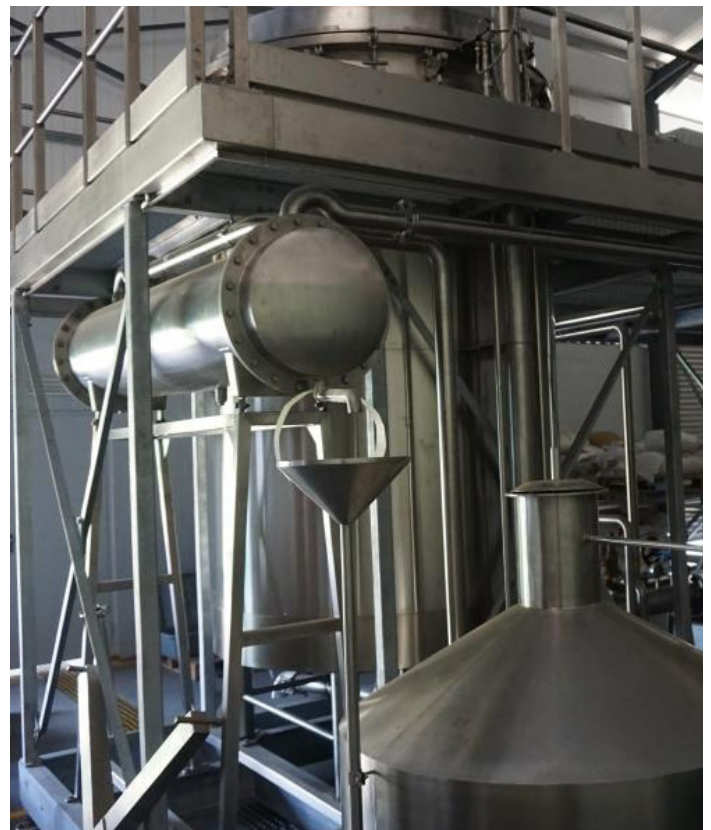
Essential oils are extracted from rosemary and lavandin in the distillation facility.