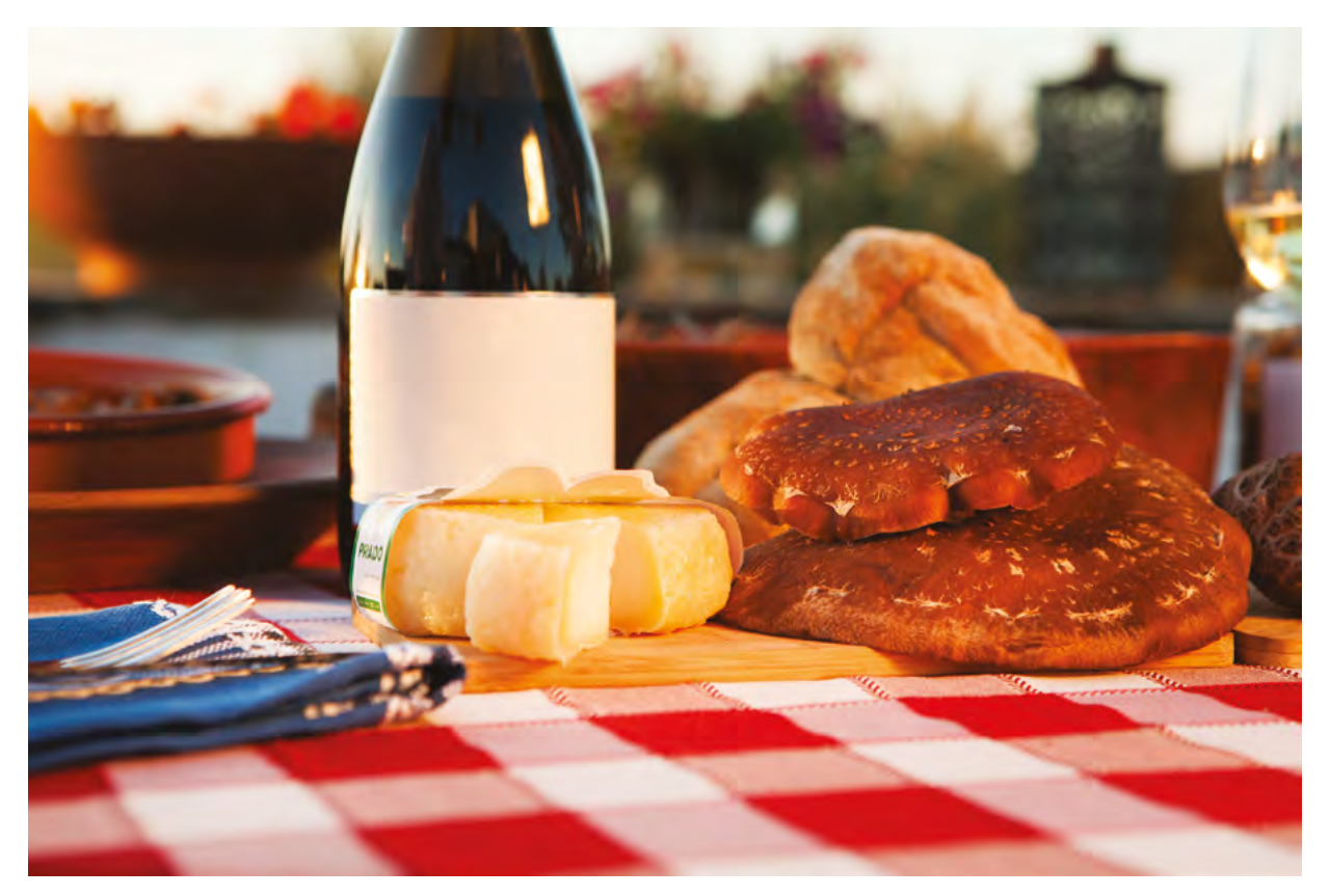
Figure 2 - Typical products of the Cork Oak Forest.

Thus, a considerable part of the information in this publication comes from the sharing of practical experience of the farm managers where the measures were implemented and the consultants who supported this implementation. Where available, and for the purposes of scientific scrutiny, reference is made to scientific publications on the issues addressed.