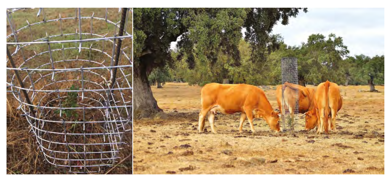
Figure 4 - Illustration of the effect of the "thorny bush" type protectors against herbivory by livestock (image on the right extracted from https://protectorcactusworld.com/pt/protetor-cactus-sebes-espinhosas-cactus/).

In March 2020, 170 cork oak seedlings from 9 months to one year old were planted in Herdade de Camarate and Herdade do Galoguizo and protectors were placed around them (and in existing seedlings from natural regeneration). 320 protectors were also placed on 8 other farms between November 2019 and April 2020<sup>6</sup>. The "thorny bush" model was used (Figure 4), given the information from several producers that this model is the most suitable, as sun-mesh protectors do not resist boars and are less resistant to livestock.