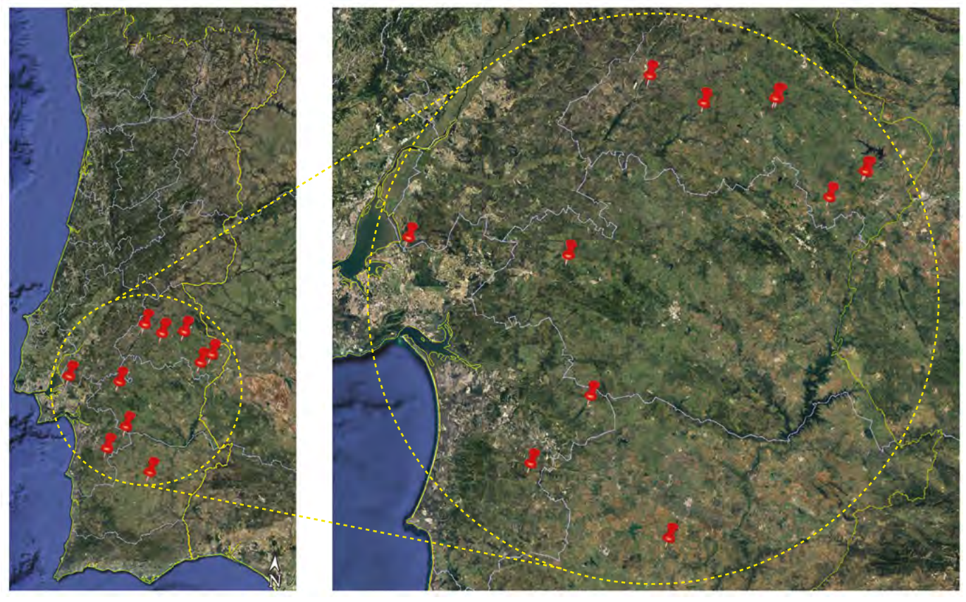
Figure 3 - Location of the project's pilot farms in mainland Portugal (marked with red pins).