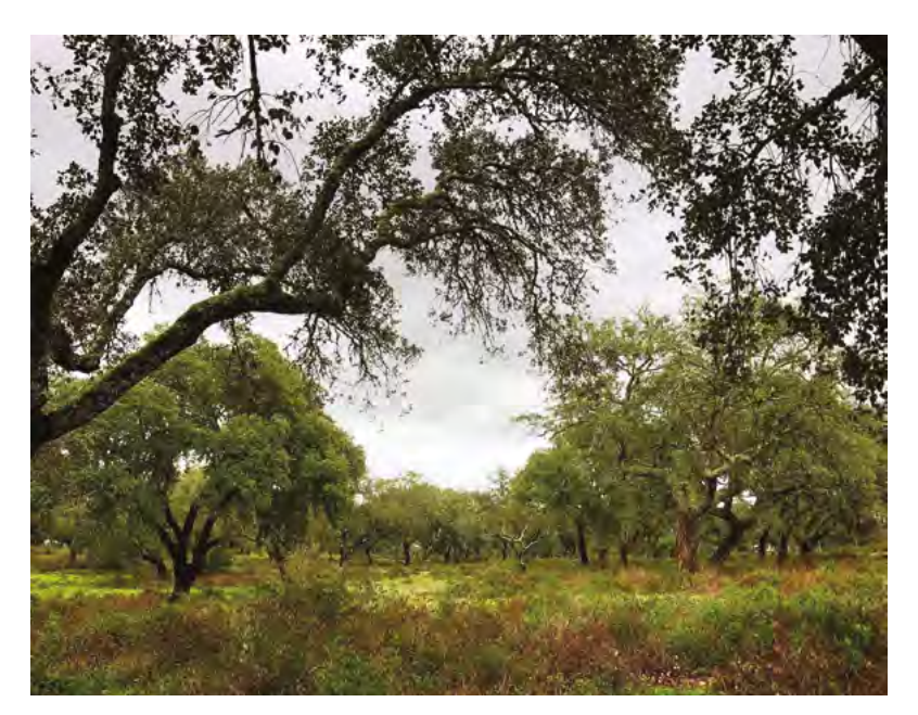
Figure 9 – Aspect of the Montado at Herdade do Freixo do Meio.

This measure is being implemented at Herdade do Freixo do Meio and integrates several measures previously addressed in this publication (in which the experience of this farm was integrated), in addition to others addressed in detail in this section. It aims to diversify the undercover of the Montado, as well as to stimulate the growth of trees and shrubs, natural regeneration and fodder species (Figure 9).