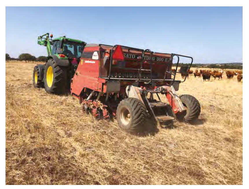
Figure 6 - No-tillage seeding at Herdade de Santo António das Paredes.

• In the sowing of meadows with no-tillage in Herdade do Freixo do Meio, using a mixture of seeds from biodiverse pastures rich in legumes, enriched with seeds of other native species (in more open areas).