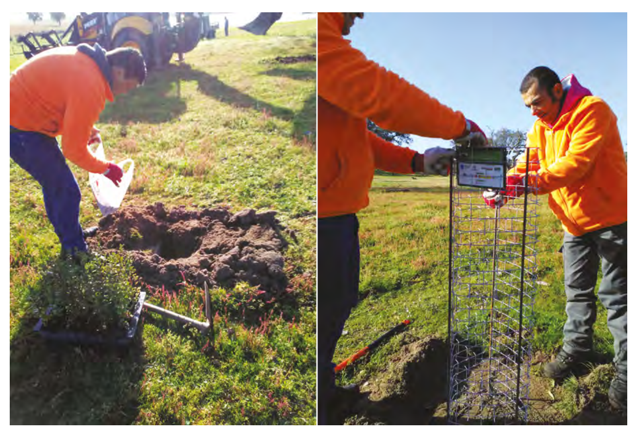
Figure 5 - Planting and application of the "thorny bush" type protectors in the protection of plants against herbivory by livestock.