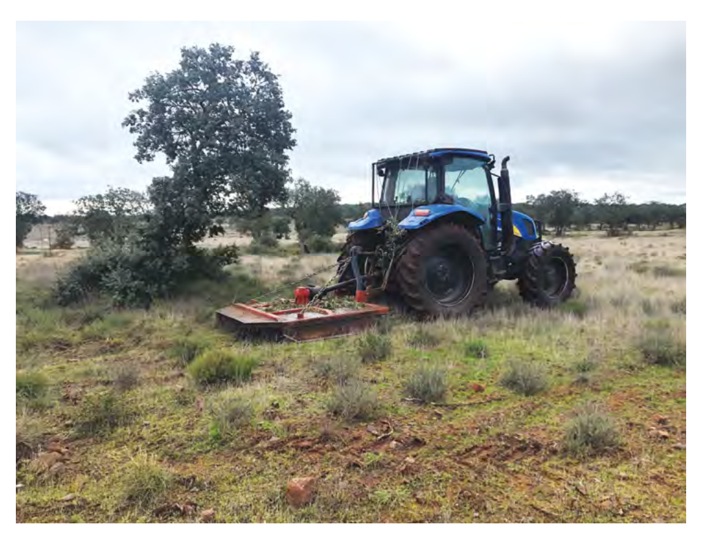
Figure 7 - Shrub control with a brushcutter in Herdade de Santo António das Paredes.

This technique should typically take place from October to March (lower fire risk period). However, the extent of the area of intervention and the period of the year should be taken into account, given the importance of shrubs for the above-mentioned fauna. The protection of habitats relevant to nature conservation should be ensured.